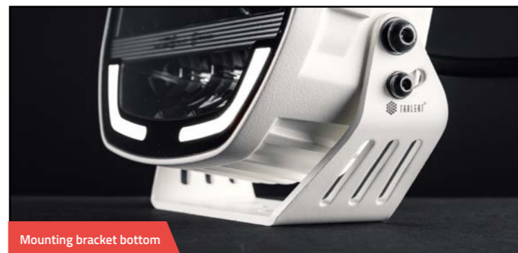
Mounting bracket bottom