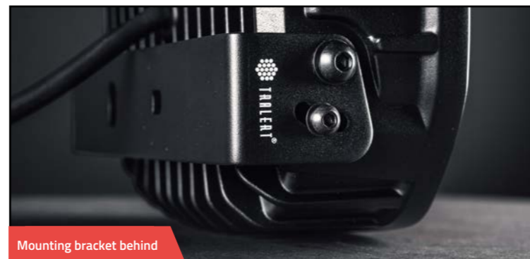
Mounting bracket behind